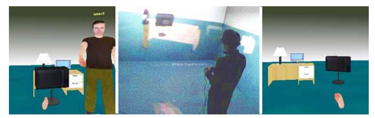
Figure 2: The scenario "Move the television" in the IPT-Desktop configuration: planning the task seen from the desktop (left), placing the TV as seen from the IPT (middle) and the TV in the final position as seen from the desktop (right).